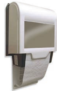
Continuous Roll Towel Dispenser

400 East 2nd Street | Boyertown, PA 19512 Phone: (610) 369.0600 | Toll Free: (866) 222.BERK | Fax: (610) 369.0676