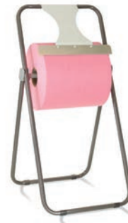
Jumbo Roll Floor Stand Dispenser