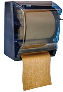
Hardwound Roll Towel Dispenser